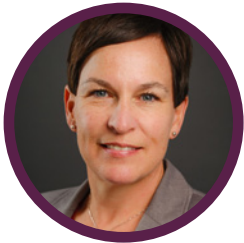
Neilane Mayhew, Deputy Minister

Public Sector Employer's Council Secretariat